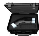
CCS to CHAdMo adapter and the box